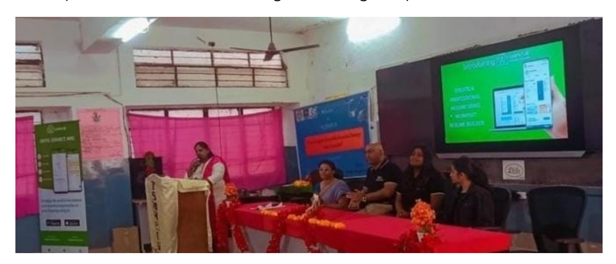
One-day medical camp was conducted by Nirmaan Organization in TSWR Law College, L. B. Nagar, Hyderabad.